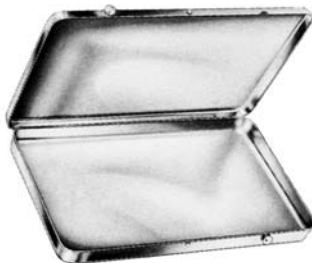
Nadelkasten, ungelocht Needle case

50x25x5 mm 47-102-11 65x40x8 mm 47-102-12 75x25x5 mm 47-102-13 70x55x9 mm 47-102-14