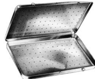
Nadelkasten, gelocht Needle case perforated