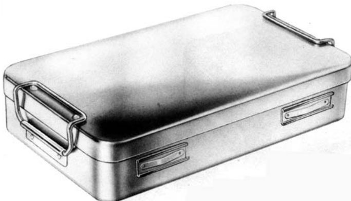
Deponette Boden perforiert Perforated bottom

230x130 mm (10 Stück) 47-304-01 260x150 mm (10 Stück) 47-304-02 275x235 mm (10 Stück) 47-304-03 300x200 mm (10 Stück) 47-304-04 325x275 mm (10 Stück) 47-304-05 420x175 mm (10 Stück) 47-304-06