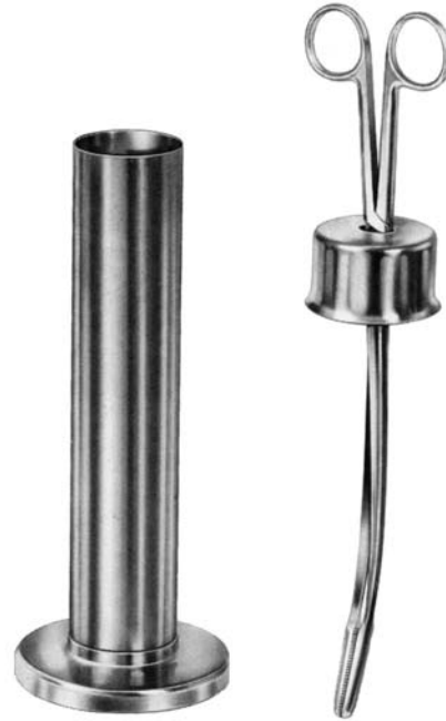
Sterilbehälter mit Kornzange Dressing Forceps in jar