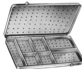
Nadelkasten, gelocht Needle case perforated