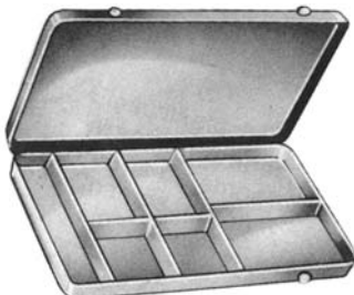
Nadelkasten, ungelocht Needle case