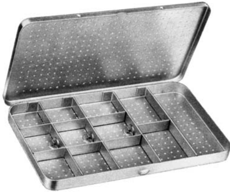
Sauerbruch Nadelkasten, perforiert Needle case, perforated